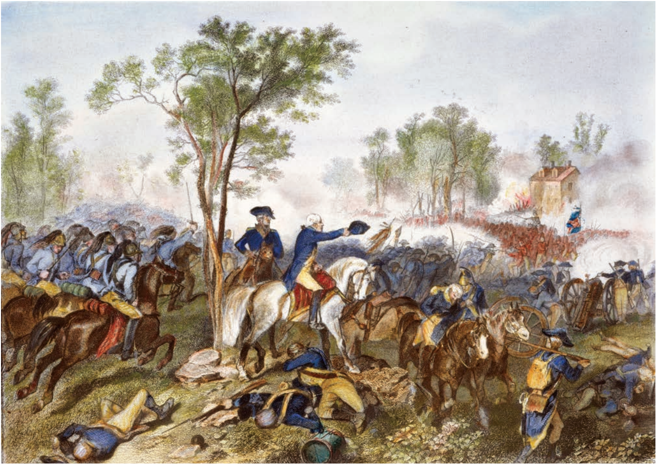
Nathanael Greene (waving hat) at the Battle of Eutaw Springs, S.C., September 8, 1781. The battle marked a decisive victory for his troops.

subsequently occupied Georgia's largest port city, Savannah. The next year, the British attacked an even larger American city, Charleston. The Continental Army there, under the command of General Benjamin Lincoln, was outmanned and under siege by the British navy and army. Surrounded, Lincoln surrendered Charleston, and more than 5,000 Continental Army soldiers were captured. Half of these Americans died during confinement. A few months later in 1780, American troops under the command of General Horatio Gates launched a failed attack on the British garrison at Camden in South Carolina. The Camden loss was so completely devastating that the Americans literally ran for their lives.