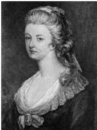
19th-century wood engraving of Mary Ball Washington, based on a painting

I n the earliest days of the National Society, even as members worked to establish the framework of the organization, Daughters took immediate action to honor the memory of the men and women who were indispensable to the fight for American independence. The subject of their initial effort never fired a weapon or held public office, but her historic significance is indisputable.