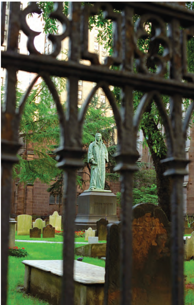
Marinus Willett is buried in New York's Trinity Church graveyard near fellow Patriots.