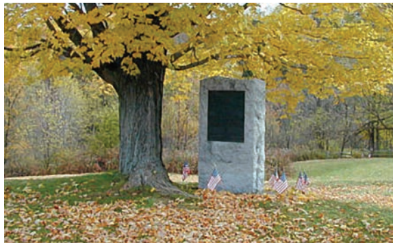
One of 14 erected by the DAR in 1912, this stone marker sits near the site of the beech tree that sheltered the seriously wounded Herkimer.

first to be shot, suffering a serious leg wound. But he steadfastly refused to be taken from battle. Instead, he continued to lead and inspired his militia to "stay and fight" throughout this more than five-hour, hand-to-hand