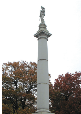
Colonel Christopher Greene Monument in Red Bank Battlefield, at the site of Fort Mercer on the banks of the Delaware River

‘That every slave so inlisting [sic] shall, upon his passing muster before Col. Christopher Greene, be immediately discharged from the service of his master or mistress, and be absolutely free, as though he had never been incumber’d [sic] with any kind of servitude or slavery.’”