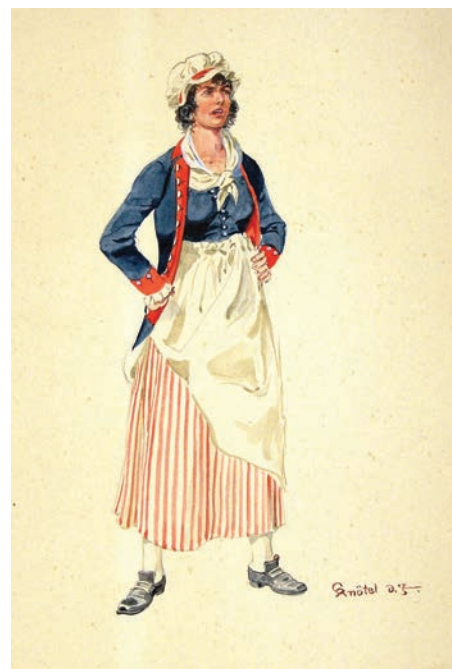
Herbert Knotel's sketch of Margaret Corbin from the West Point Museum Art Collection, U.S. Military Academy

“Camp followers,” as the thousands of wives and women who followed the Continental Army were called, traveled with the soldiers seeking safety, shelter and food. Corbin was one of the many women tasked with cooking, mending clothing, fetching water, and nursing the sick and wounded. At some point she learned to clean, load and fire a cannon—a skill that would prove valuable during the Battle of Fort Washington, where