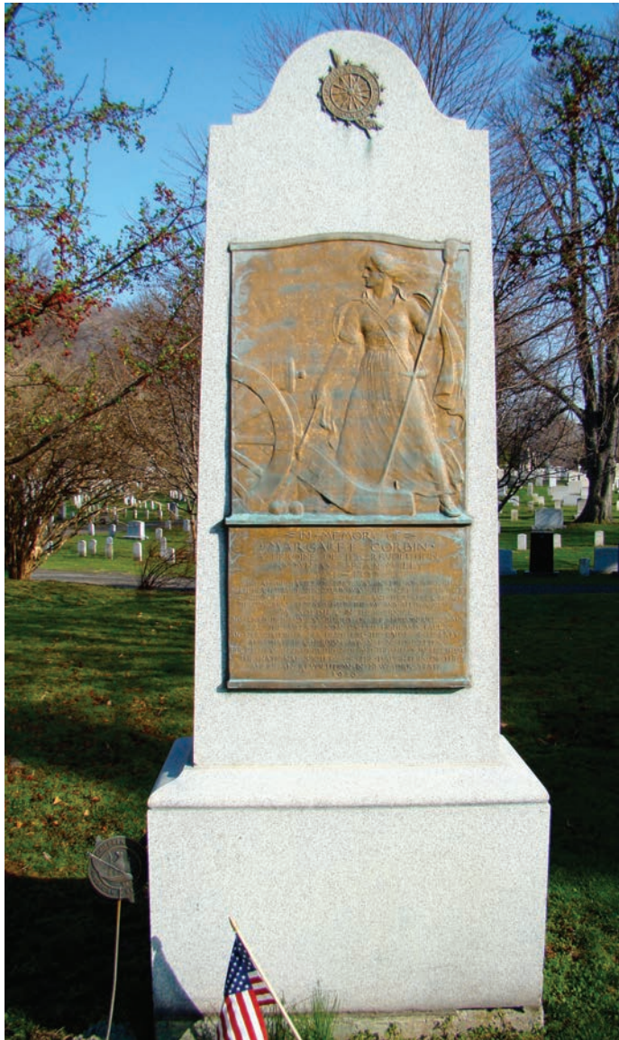
The Margaret Corbin Memorial at West Point Cemetery on the grounds of the U.S. Military Academy

across the river, is said to have wept at the sight of the surviving prisoners being marched out and murdered by the Hessians. The loss of Fort Washington was not only a demoralizing defeat for Patriot troops, but it also forced Washington to admit his mistake in trying to retain control of New York and retreat to New Jersey.