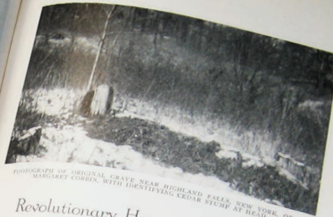
PHOTOGRAPH OF ORIGINAL GRAVE NEAR HIGHLAND FALLS, NEW YORK, OF MARGARET CORBIN, WITH IDENTIFYING CEDAR STUMP AT HEAD.