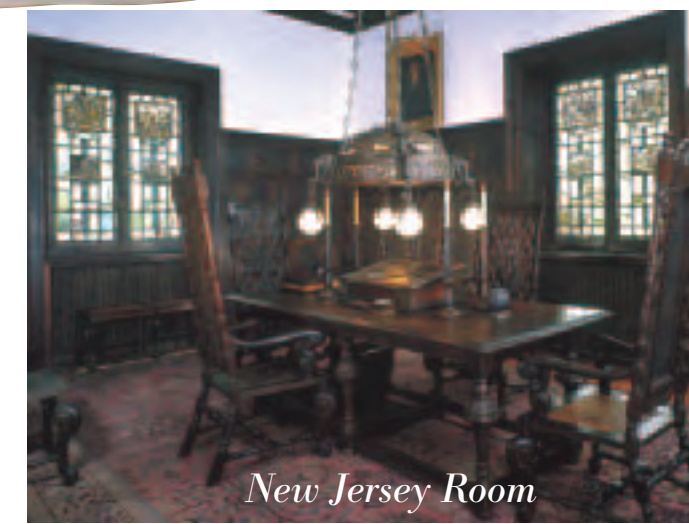
New Jersey Room