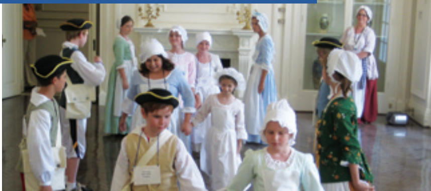
Children at the Colonial Summer Camp performing a period dance in traditional colonial costume.

How the Heritage Club supports Historic Preservation, Education, and Patriotism.