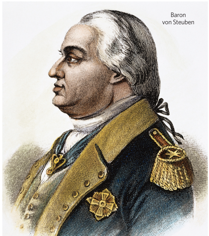
Baron von Steuben

The transformation was evident. When the army paraded May 6, 1778, to celebrate France's alliance with America, it was a celebratory showcase. Cannons boomed and muskets were fired in glorious precision as the men demonstrated the skills they had honed. The Continental Army had reached a turning point, though the war would continue.