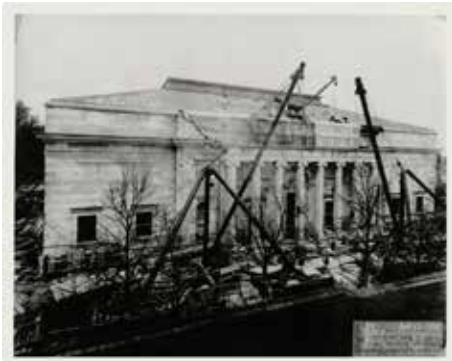
Clockwise from above: Constitution Hall under construction. •As described in an October 23, 1929, press release announcing the opening of the Hall, “The interior resembles a stadium in form, with tiers of seats rising on three sides from the auditorium floor.” The original glass skylight seen here was covered in the 1950s. • Constitution Hall hosted the world premiere of the film “Mr. Smith Goes to Washington” on October 17, 1939.

Constitution Hall filled a void in the social and cultural landscape of Washington, D.C. From the early planning stages, Daughters intended to rent the building to the public when not in use by the National Society, and the public