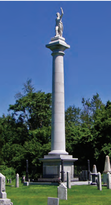
Don't miss these Ethan Allen-related sites in Burlington, Vt.: The Ethan Allen Homestead and (left) his grave and monument in Green Mount Cemetery.