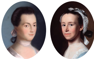
Abigail Adams, left, and Mercy Otis Warren, two of Winthrop’s confidantes

Some members of the Cambridge militia marched toward Lexington while others waited at Harvard Square for the Redcoats to return. As the war began taking shape before her eyes, and as she and other women in Cambridge were urged to leave the town, Hannah wrote to Warren about her experience: