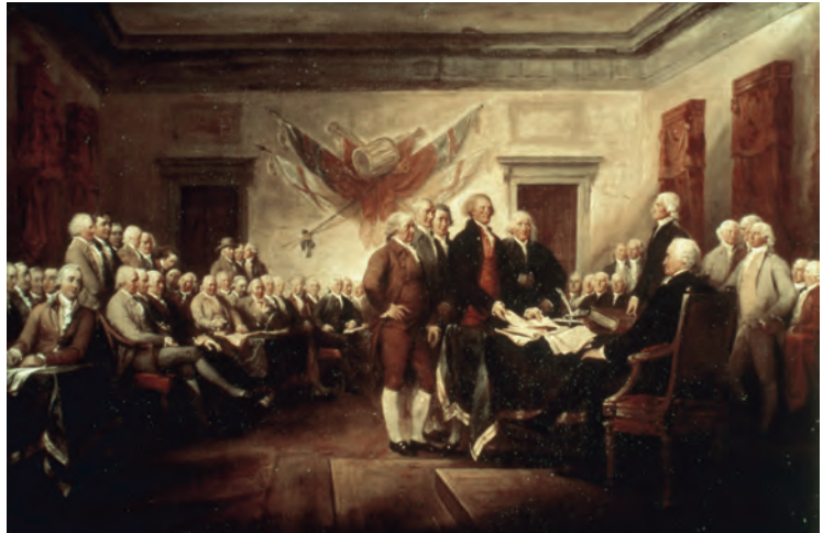
“Declaration of Independence, July 4, 1776,” oil on canvas by John Trumbull. John Witherspoon was the only clergyman and college president to sign the document.

In January 1777, the college was only three miles away from the Battle of Princeton, in which Washington claimed victory and revived the Patriots’ chances. About 200 British troops took refuge in Princeton University’s Nassau Hall