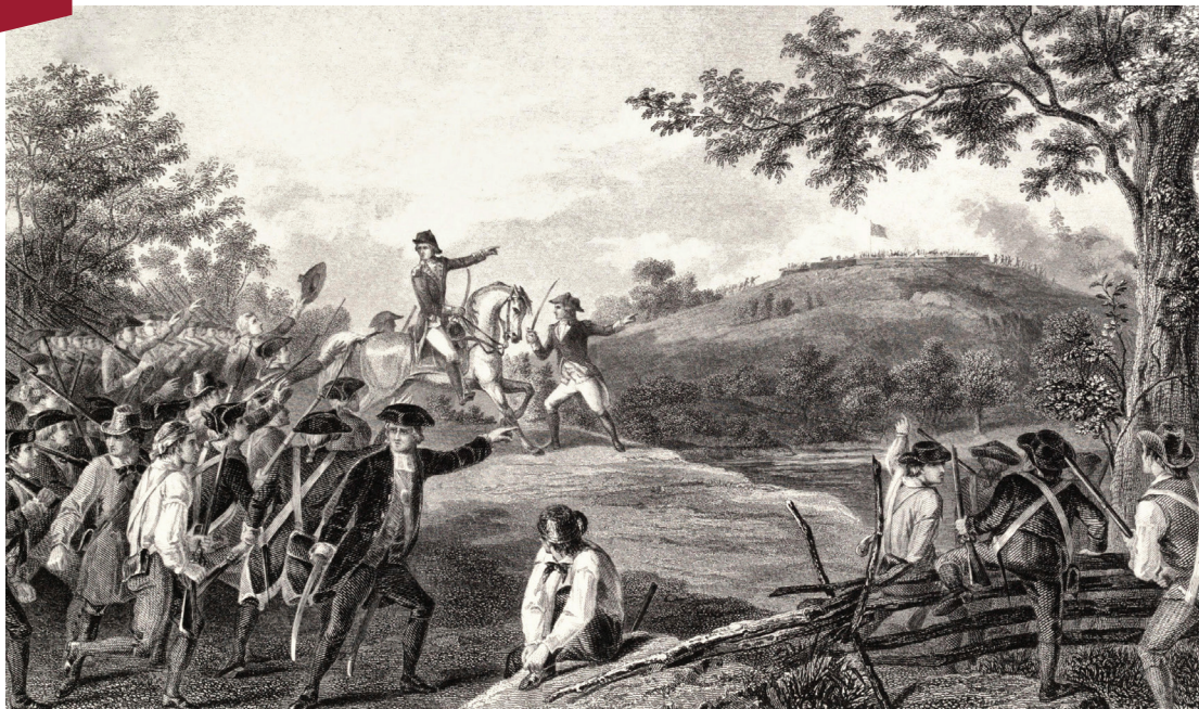
Brigadier General John Stark's militia played a critical role in the Battle of Bennington, Vt., on August 16, 1777. Brig. Gen. Stark's army assaulted a smaller British unit intent on raiding American supplies.