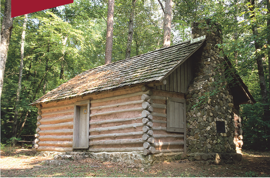
In 1932, the Stephen Heard DAR Chapter and Nancy Hart DAR Chapter erected a replica cabin at the site of Nancy Hart's cabin, which had been washed away in a flood.