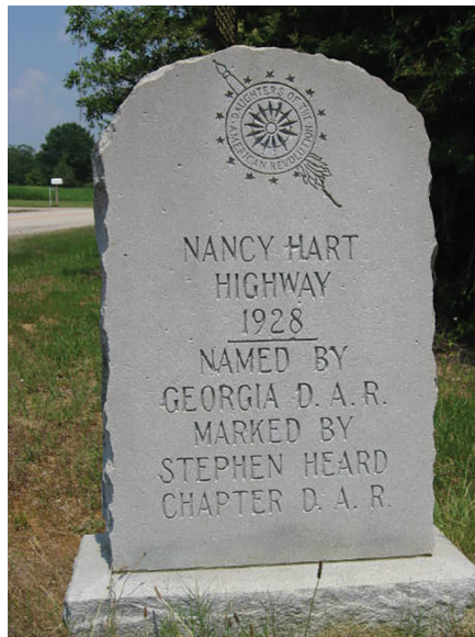
In 1928, Georgia Route 77 was renamed the "Nancy Hart Highway" by the Georgia State Society DAR and marked by the Stephen Heard DAR chapter. The marker is located in Hart County, Ga.