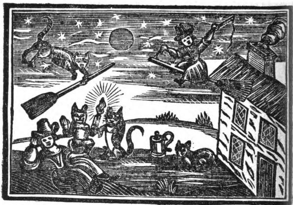
Witches at an Assembly, from a Capital Piece, by Albert Durer, as supposed by the hardness of the Drawing.