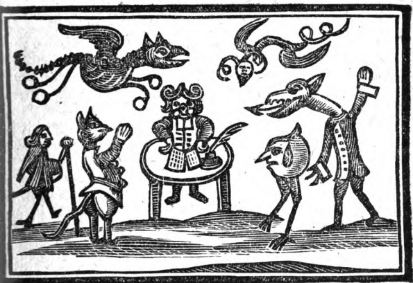
The Hobgoblin Society, from an Original Painting of Salvator Rosa.