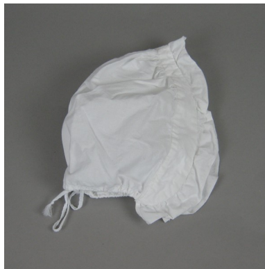
Milliner: Girl's Cap