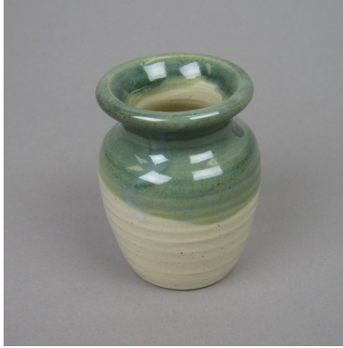
Potter: Clay pot