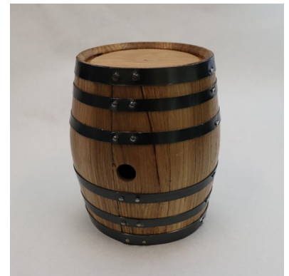
Cooper: Cask (Could also be used by the cook or sailor)