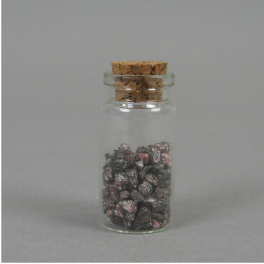
Dyer: Jar of Dyestuff (Cochineal) (Could also be used by the apothecary)

Keep in mind that each item could connect to more than one job