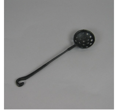
Blacksmith: Iron spoon (Could also be used by the cook)