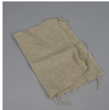
Weaver: Cloth (Could also be used by the milliner)