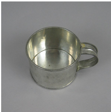
Tinsmith: Tin cup