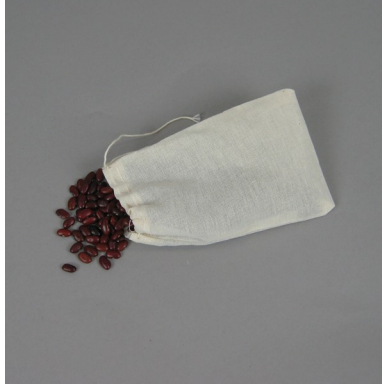
Farmer: Bag of Seeds