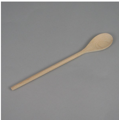
Cook: Wooden spoon