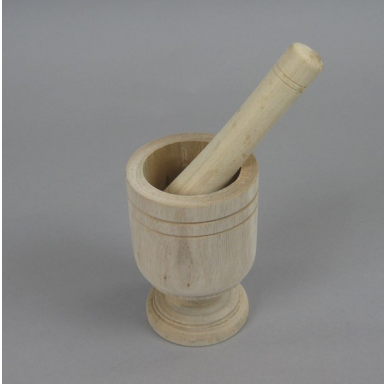
Apothecary: Mortar & pestle (Could also be used by the dyer)

Keep in mind that each item could connect to more than one job