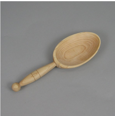
Miller: Wooden scoop