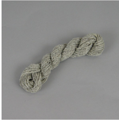
Spinner: Yarn (Could also be used by the weaver)