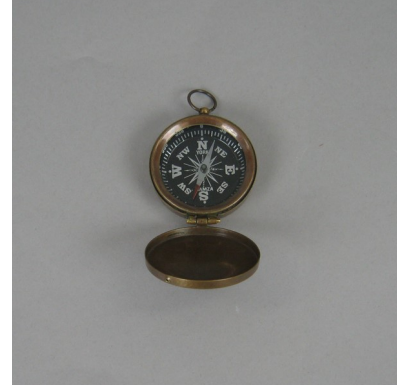
Surveyor: Compass (Could also be used by the sailor)