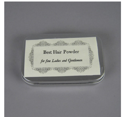
Wigmaker: Tin of hair powder