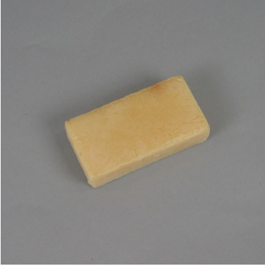
Soapmaker: Soap (Could also be made by the chandler)

Keep in mind that each item could connect to more than one job