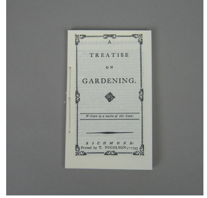
Printer: Printed book