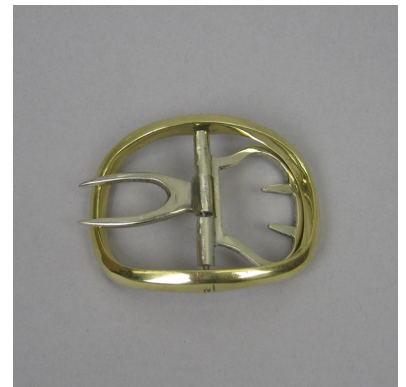
Shoemaker: Shoe buckle