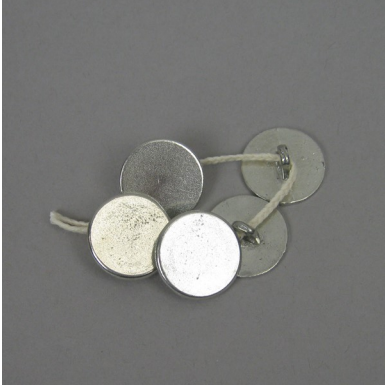
Pewterer: Pewter buttons

Keep in mind that each item could connect to more than one job