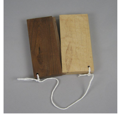
Joiner: Wood cut so it fits together