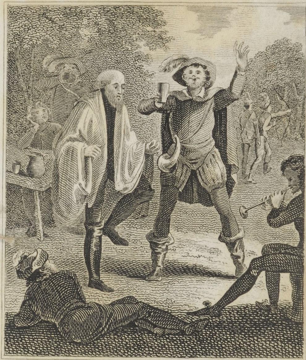
Robin Hood making the Bishop of Hereford dance.