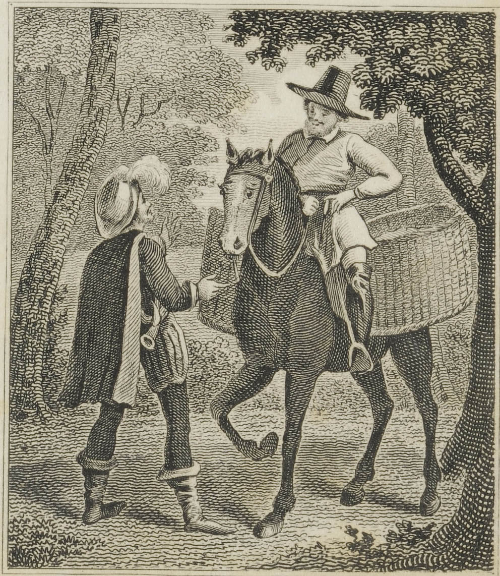
Robin Hood bargaining with the Nottingham Butcher.