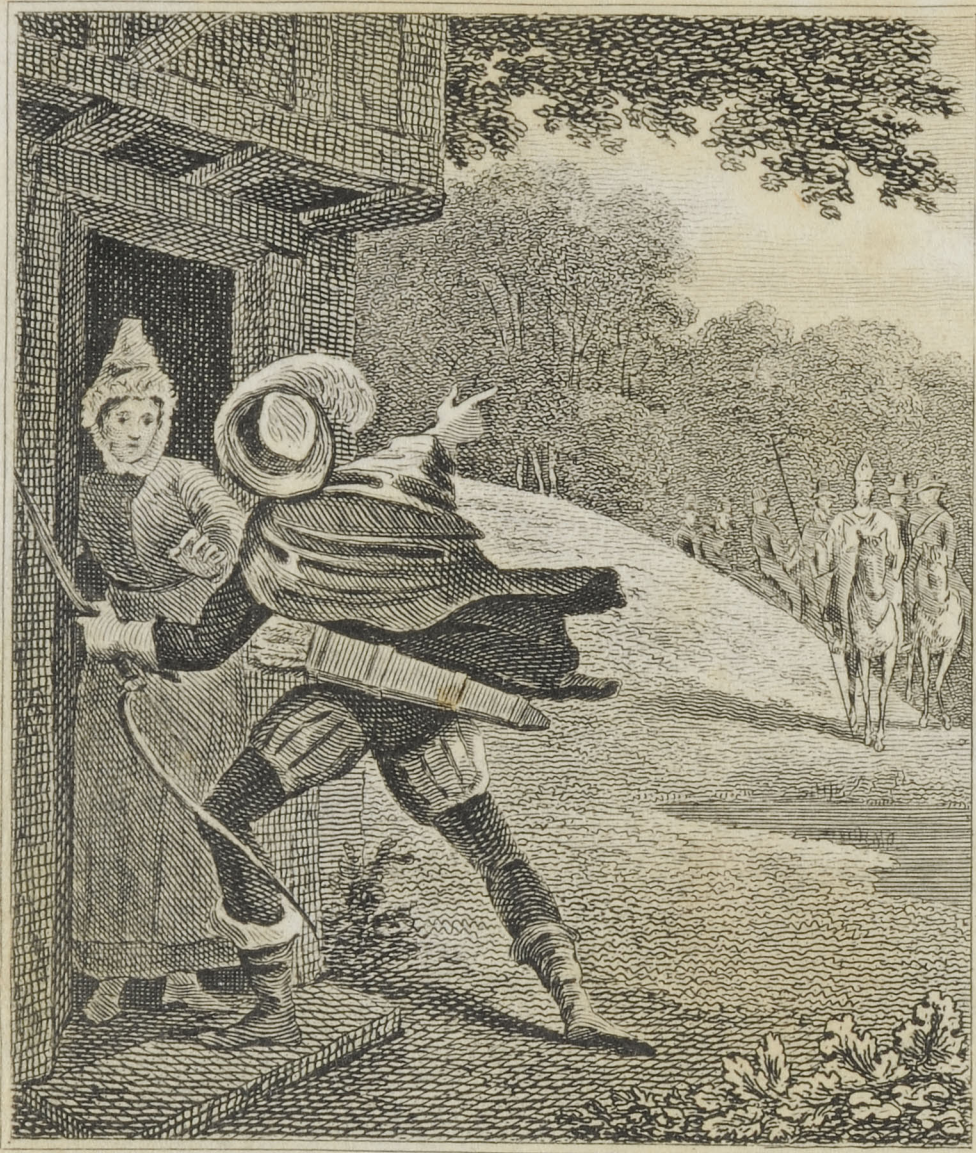
Robin Hood flying for shelter from the Bishop of Hereford.