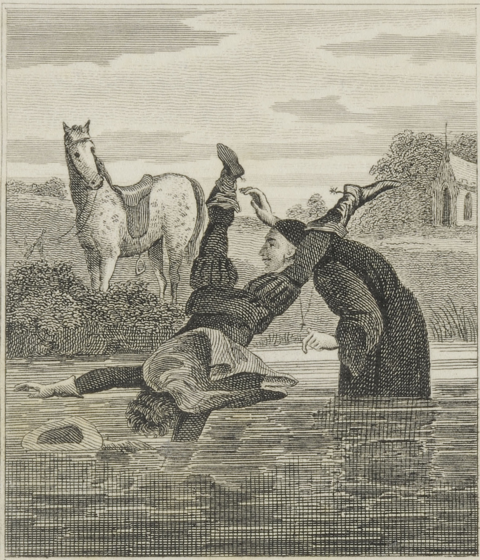
The Friar throwing Robin into the River.