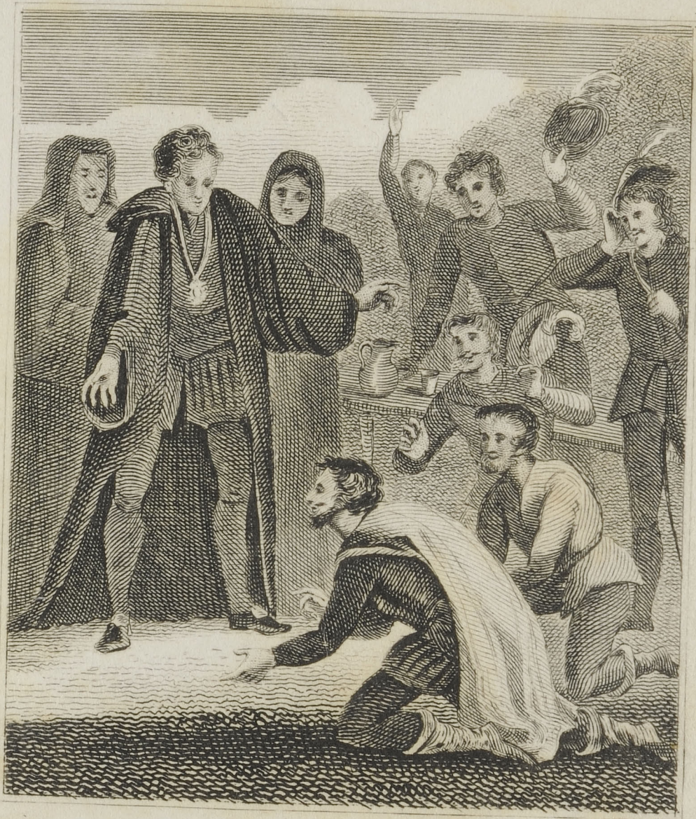
KING RICHARD discovering himself to Robin and his company.