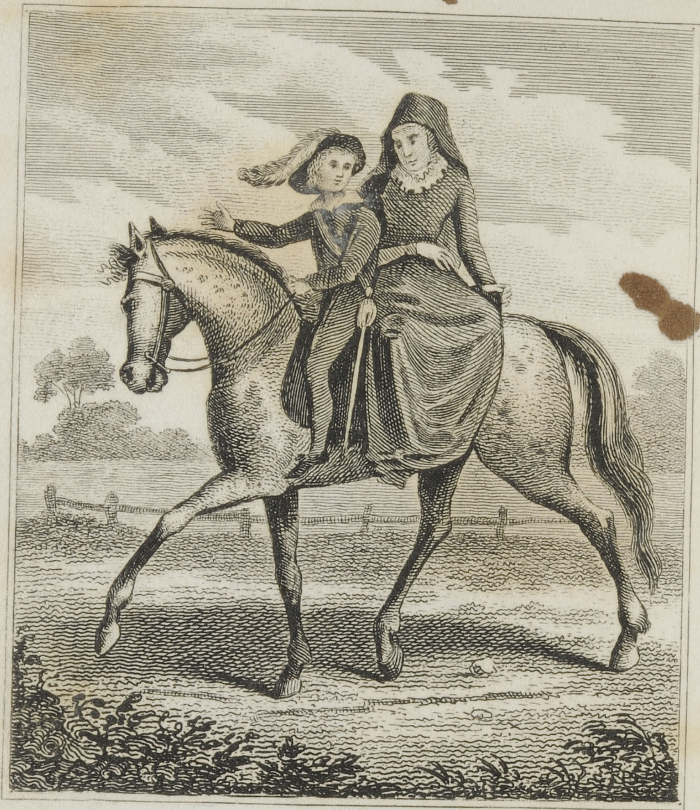
Robin and his Mother going to Game- well Hall.