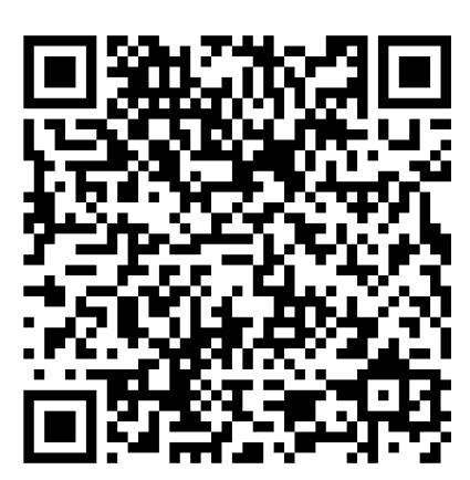
Scan to access this resource online!

Congress's Response: www.govinfo.gov/content/pkg/SERIALSET-00336_00_00-119-0939-0000/pdf/SERIALSET-00336_00_00-119-0939-0000.pdf