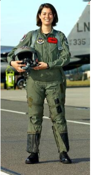
Air Force Pilot