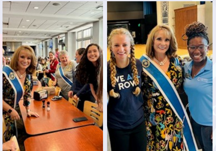
Touring the lunchroom and auditorium with some of the female students who attend Berry College.