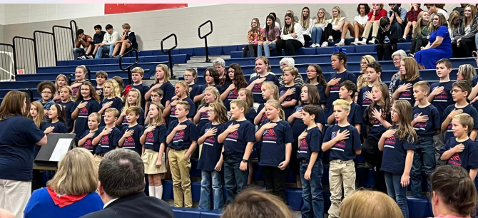
Kate Duncan Smith DAR School students recite the Pledge of Allegiance during Dedication Day on September 30, 2022.