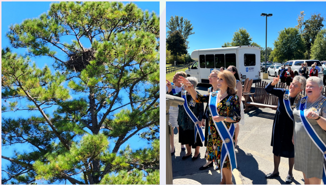
The President General and members of the National Executive Board view the Berry College eagles nest; a popular "nest cam" tracks a bald eagle couple on campus.