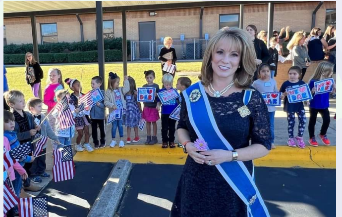
The President General greeted by students from Kate Duncan Smith DAR School in Grant, Alabama.